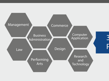
30+ Diversified Programmes